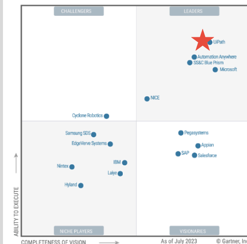
Figure 1: Magic Quadrant for Robotic Process Automation