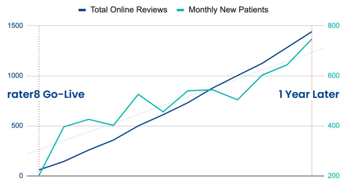
1-Year Growth in Online Reviews & New Patient Volume