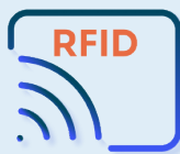
Cutting-edge RFID Technology

Pycube emerges as a beacon of efficiency in the face of asset hoarding challenges. Utilizing intelligent software combined with cutting-edge RFID technology, Pycube's solution provides hospitals with a powerful tool to combat asset hoarding and elevate operational excellence.